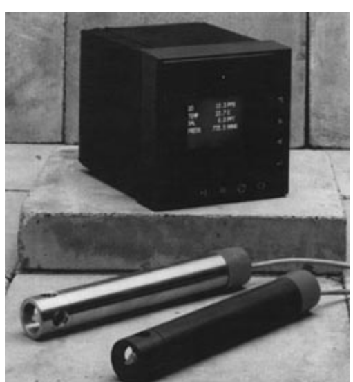
Honeywell 7020 Series Dissolved Oxygen System

Although the Honeywell probe accuracy is unaffected by inert fouling, there are two conditions where probe cleaning may be required. (These conditions affect all conventional dissolved oxygen probes as well.) The first is where the fouling is so thick that the response time of the probe becomes unacceptably long. The second is where organic fouling is consuming oxygen before it reaches the surface of the probe. A feature allowing automatic cleaning at preconfigured times is included in the 7020 series analyzer. Cleaning may be initiated with a frequency of every few minutes to monthly. Functionally, relays within the analyzer are tripped, allowing withdrawal of the probe from the sample, turning on a cleaning spray, turning off the spray, and reinserting the probe into the sample. Execution of automatic cleaning and calibration requires the user to install a drive unit, a solenoid valve, and mounting hardware.